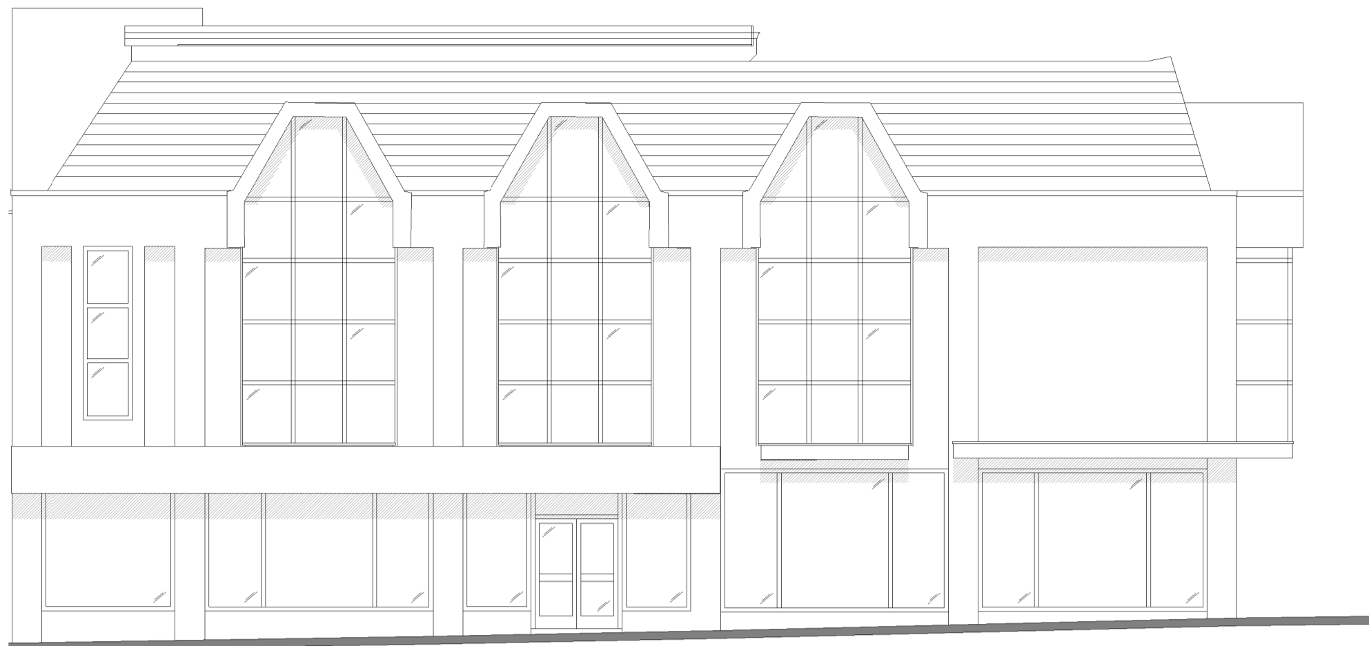
① Proposed Elevation - North 1 : 100