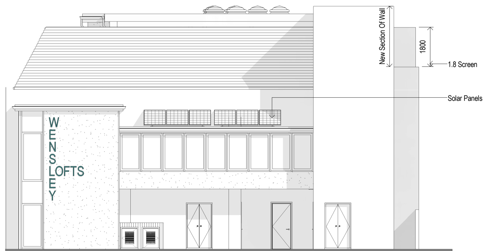
③ Proposed Elevation - South 1 : 100