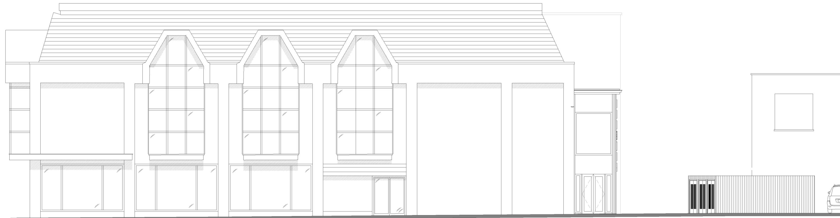
② Proposed Elevation - West 1 : 100